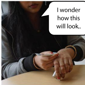
User opens new product

One of the biggest problems makeup users have is finding the right makeup for their skin tones and being able to see what fits them before purchasing a product.