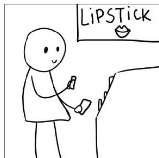
User browses lipstick display, with smartphone in hand