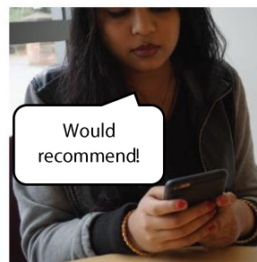
Writes product review on app