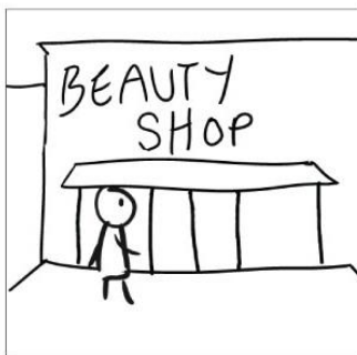
User goes to makeup store with intent of purchasing products