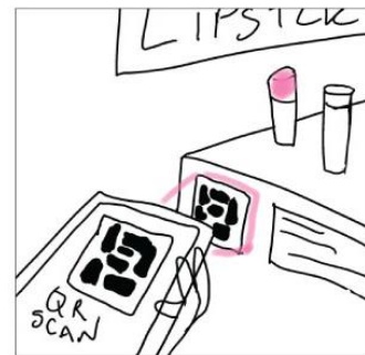
User uses phone app to scan a QR code near the product description