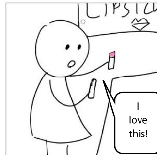
User decides to purchase product based on app preview