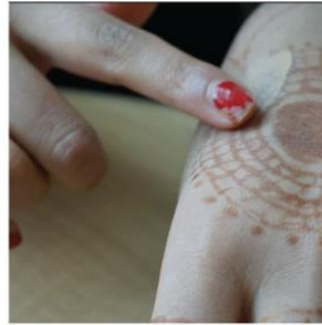
Tests product on skin