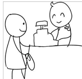
User makes purchase